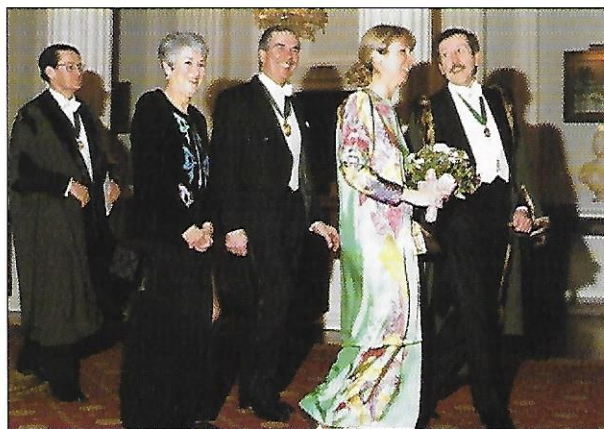
The Renter Warden and his wife, escorted by the Learned Clerk on their way to dinner.