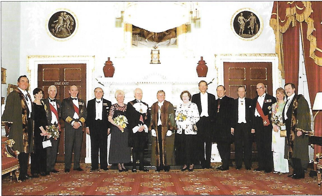
Our group photograph shows the Master and Wardens and their ladies with our principal guests at the Annual Banquet, held at the Mansion House (see story on page 1).