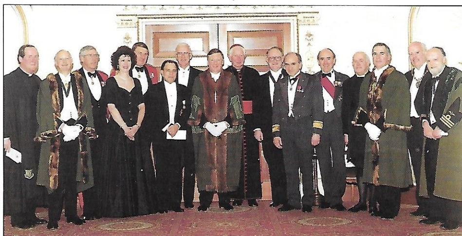
Our photograph shows The Master and Wardens together with the Clerk and the principal guests at Plaisterers Hall with two of our honorary liverymen representing Her Majesty's armed services.

An excellent programme of music by the Royal Artillery Orchestra complemented the evening.