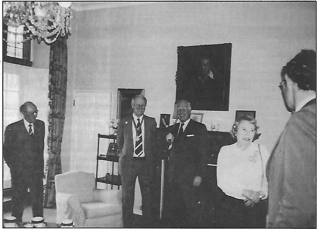
Pictured above and below: the Master and Winston Churchill MP at Chartwell.